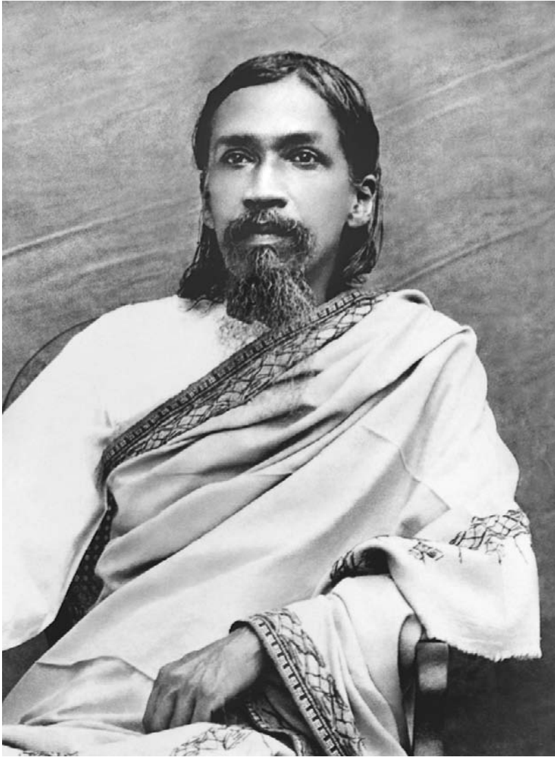
Sri Aurobindo in Pondicherry, c. 1915–1918