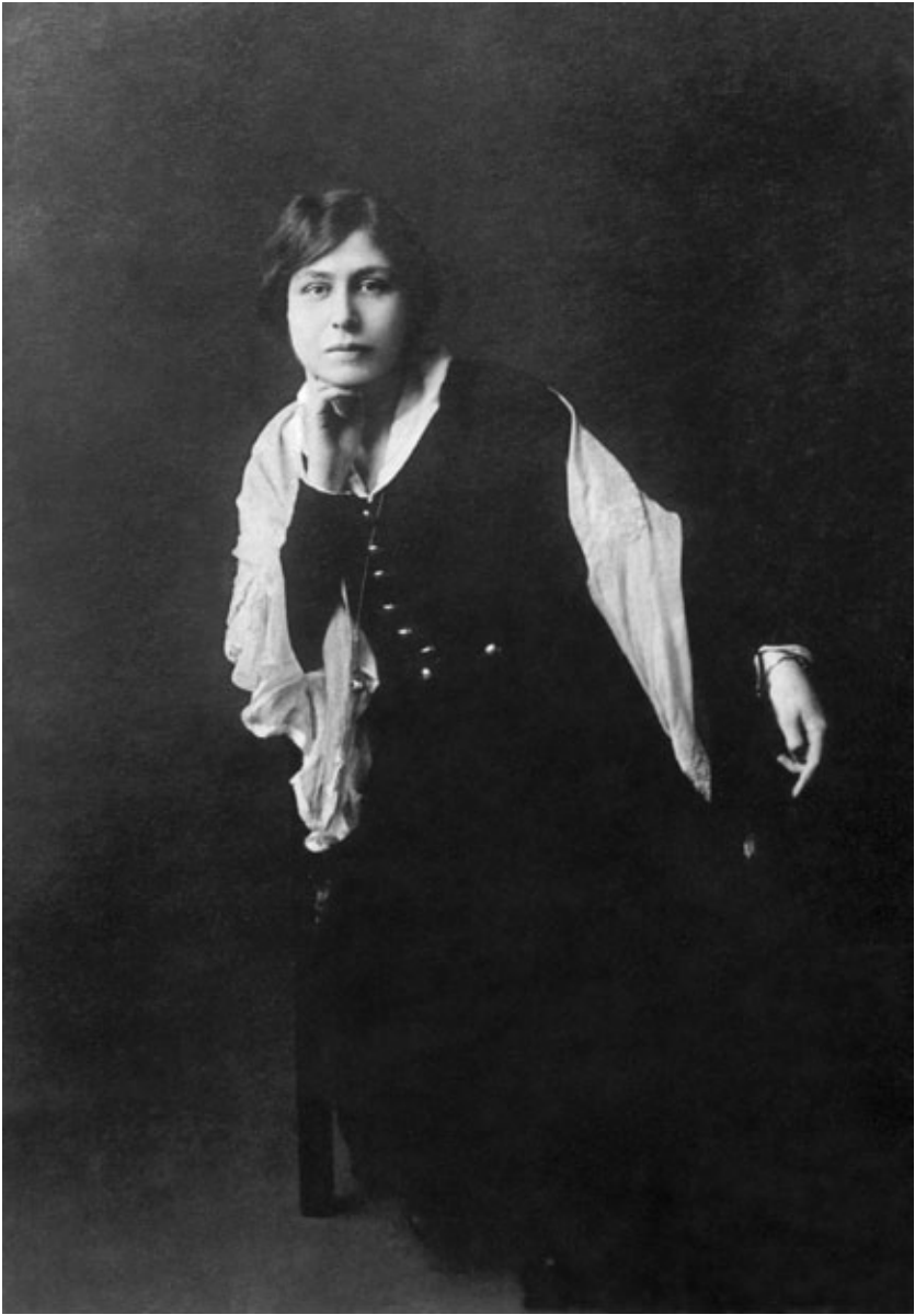
The Mother in Tokyo, 1917