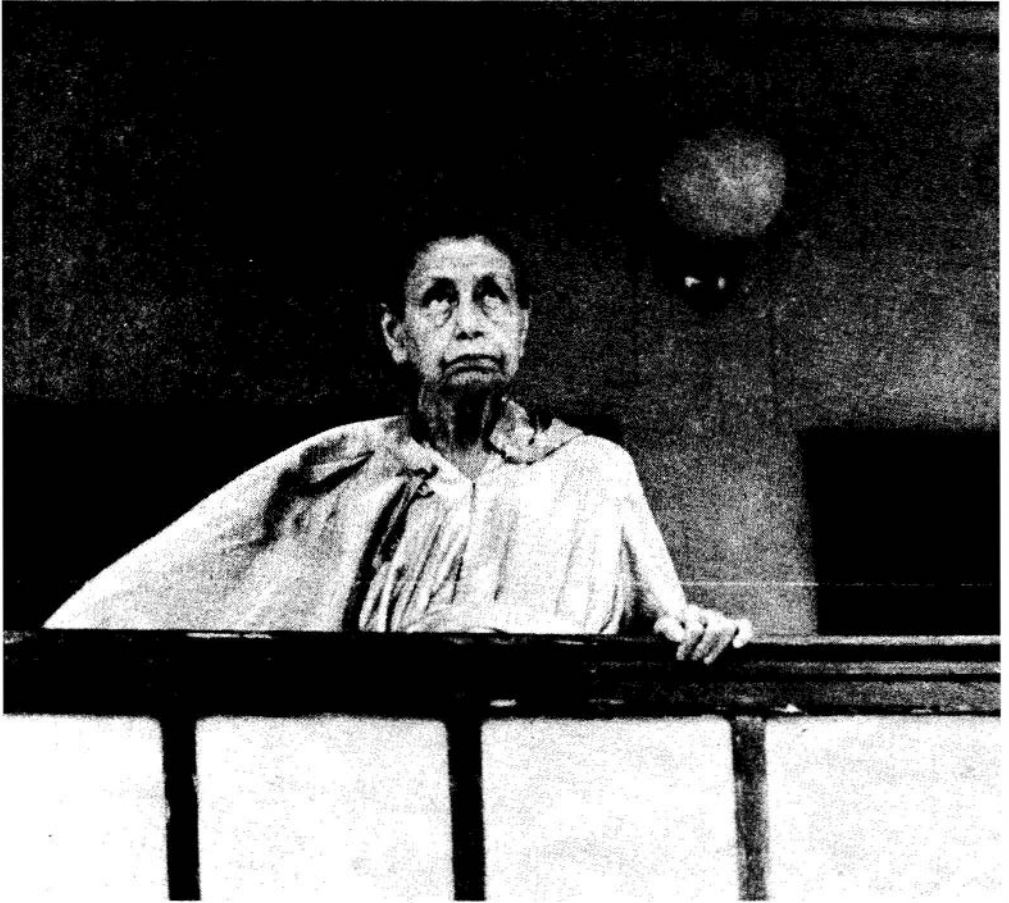
THE MOTHER - 1964