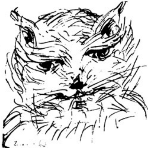
A happy cat sketched by the Mother to cheer up her unhappy disciple