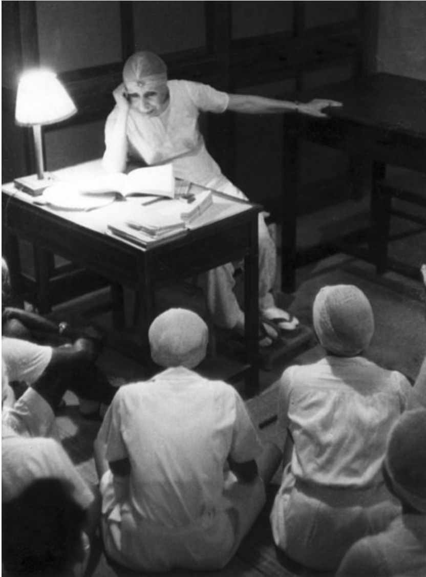
The Mother taking a class, April 1950