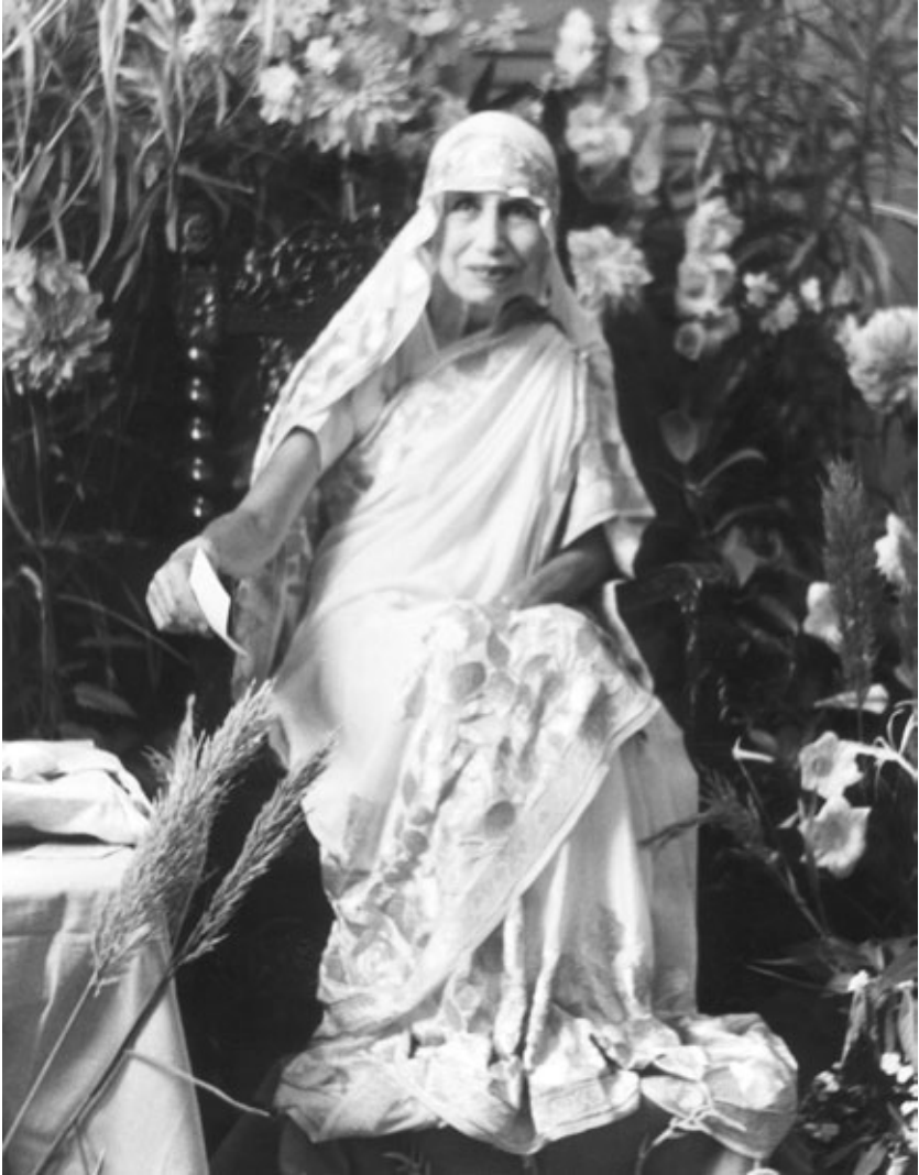
The Mother, 1954